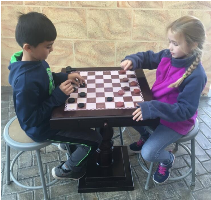
Field Trip: Second grade took a field trip to Science City. Fun!