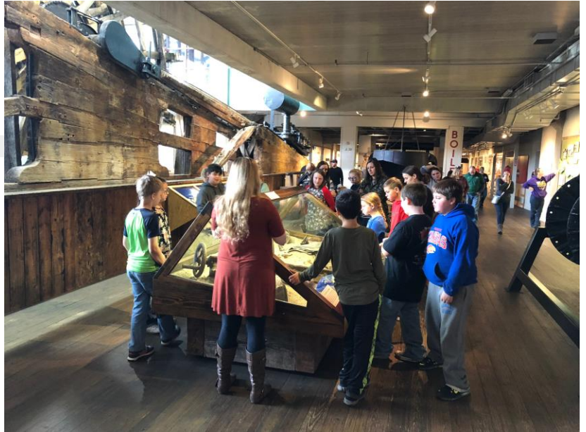
Field Trip: Fifth grade took a field trip to Steamboat Arabia.